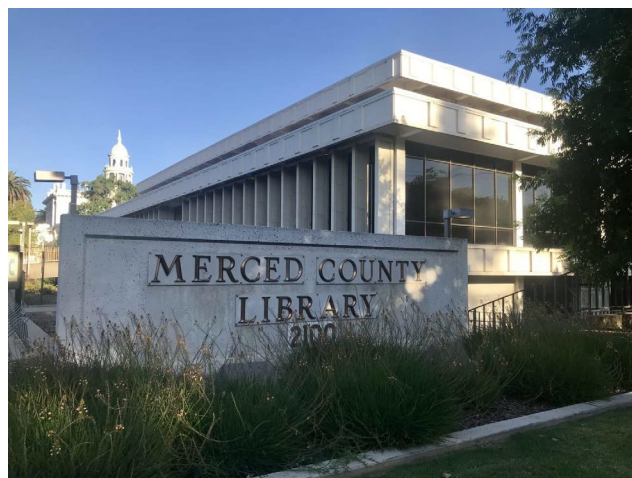
Merced County Library, 2100 O Street, Merced. Parking is available in the front of the building.